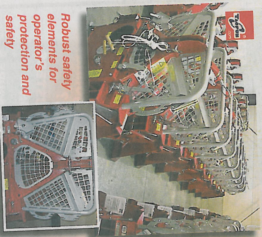
Robust safety elements for operator's protection and safety

CARS - PEOPLE - LIVESTOCK - DEBRIS - ROAD - SEA - LOGS & TREES Radio remote can be operated in 200m radius , and with 150m of wire, kevlar ,or optima soft rope, this wombat winch is safe, reliable and is unstoppable in any given situation.